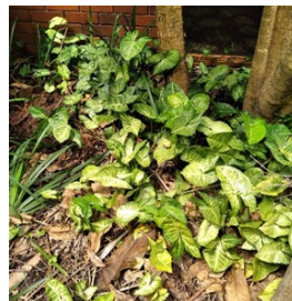
Arrowhead Vine (Syngonium)