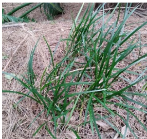
Native Grass (2)