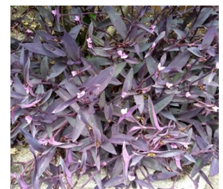
Variegated Wandering Jew