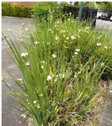
Peacock Flower (Dietes Bicolor)