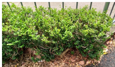
Japanese Box (Buxus Micophyalla)