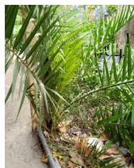
Phonix (Date) Palm