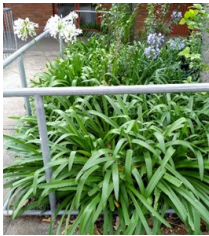
White & purple agapanthus